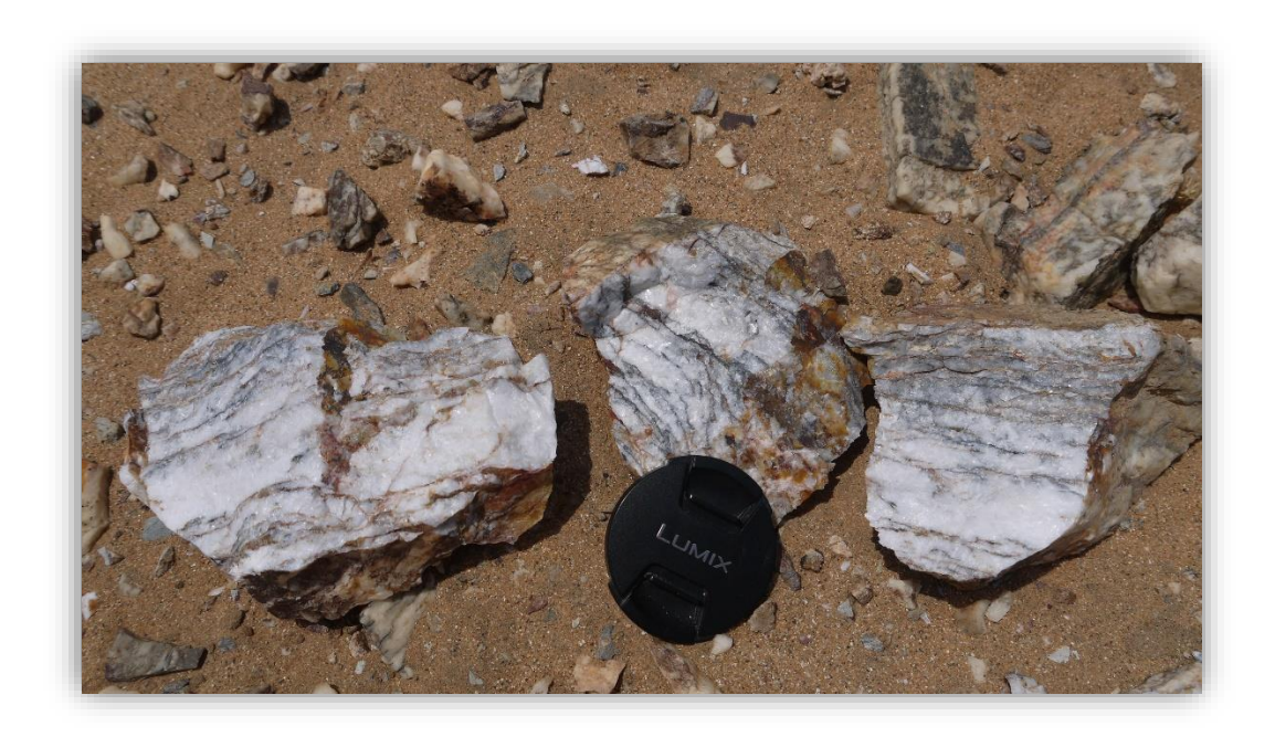
Figure 2 - Quartz material with banded sulphides taken from ancient crush dumps within the JQ SE licence