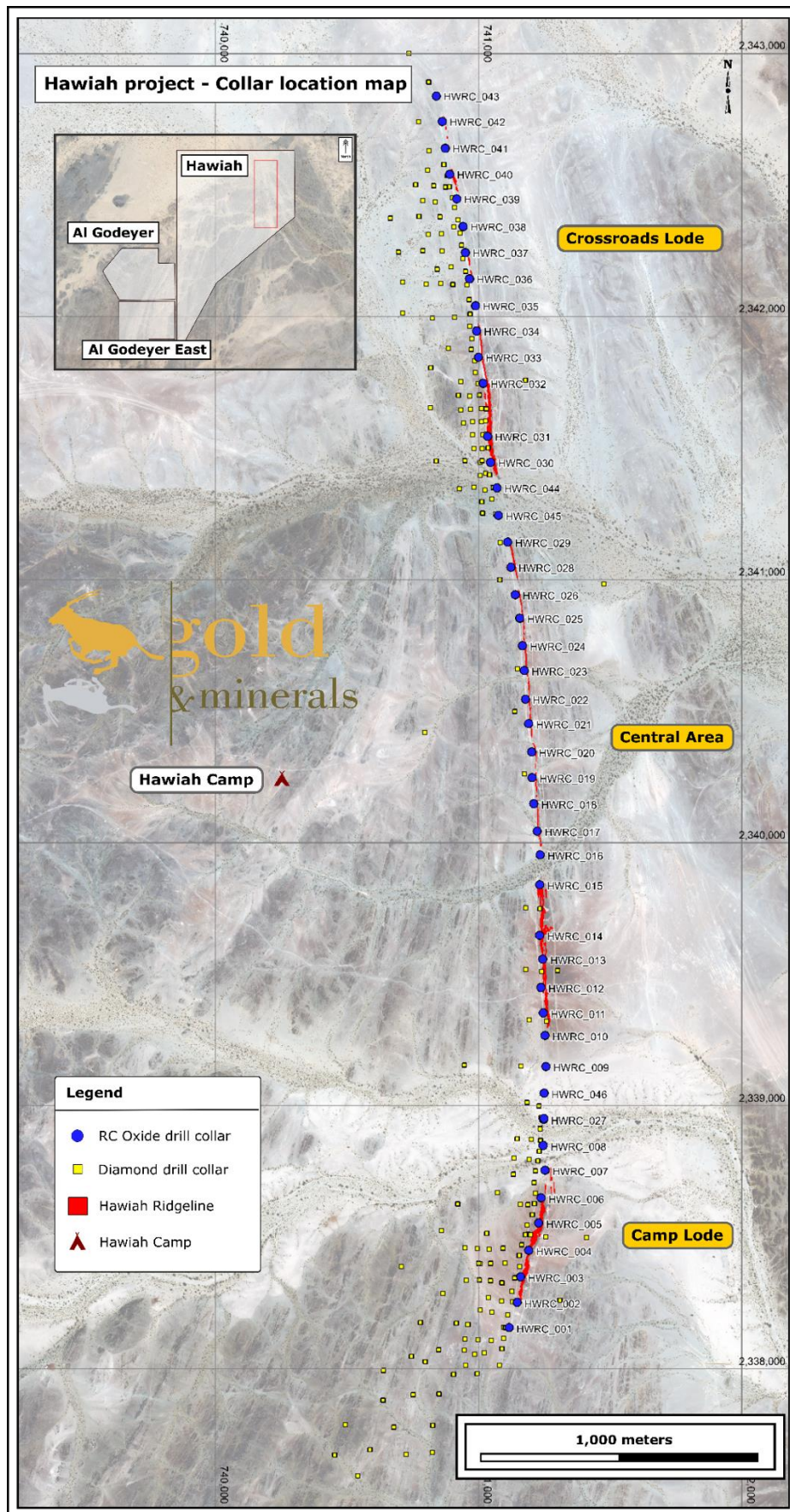
Figure 2 -Collar location map for the Phase 1 Oxide RC program (blue) and other resource drilling (yellow)